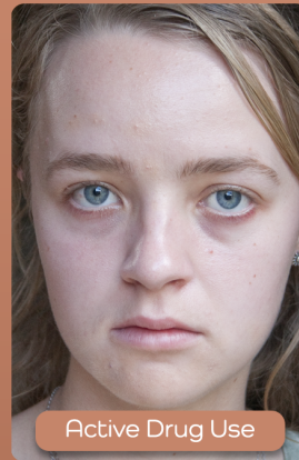
Active Drug Use